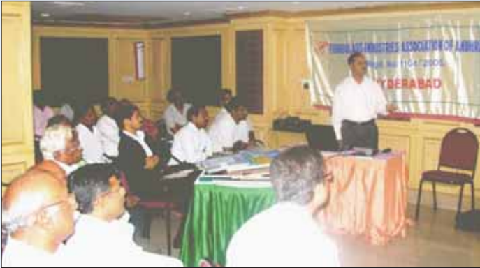
A training class in progress

A Training course on Manufacturing Techniques of World class composites was conducted on 26 Jul 2008 at Hotel Belson Taj, Secunderabad. The training