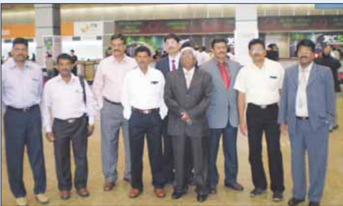
Some of the delegates for JEC Composite Show at Singapore

During the session various points were discussed about FRP Cluster formation, and the action plan for getting it approved from our Government, the need and use of the above plan, were discussed in length. They were impressed and appreciated our Association's efforts in this regard.