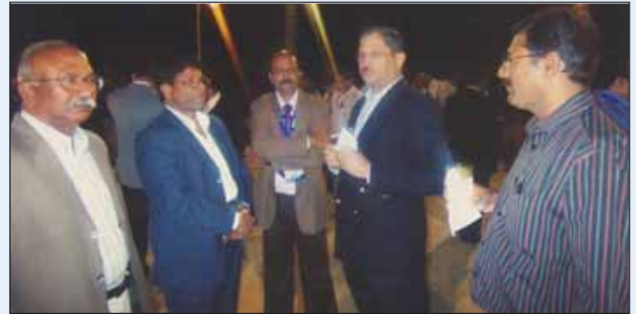
FIAAP deligation with OCV CMD