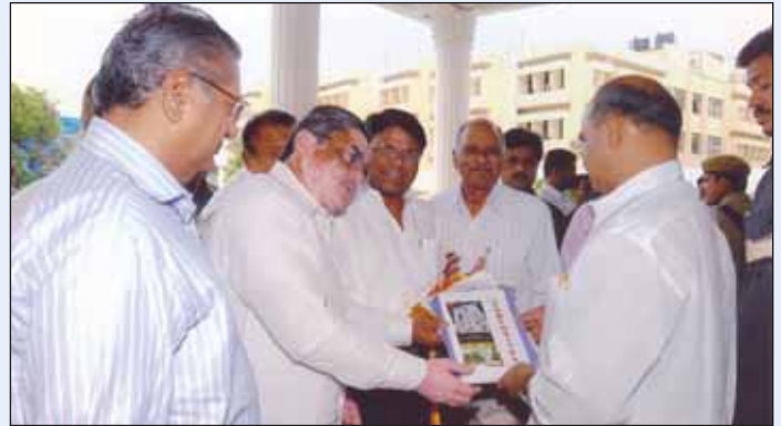
A brochure being released by Dr. Y.S. Rajashekar Reddy, Chif Minister of Andhra Pradesh

We are glad to inform all members the activation of our association Portal and well linked to Google and other advanced searches. A representative team of two designer Engineers are already visiting all units/ members. All the members are requested to pay the One time listing fee of Rs. 200/- and an activation cum linkage fee of Rs.500/- per annum by cheque only to the representatives. Cheque should be drawn on "Fibreglass Industries Association of Andhra Pradesh"