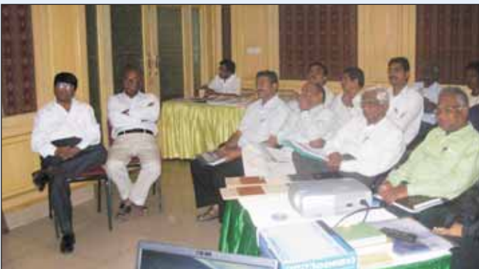
A section of participants

classes were taken up by well experienced faculty and professionals from Epsilon composite Solutions, Pune. The following topics were covered in the day long course. Pattern making, Mould construction, Release systems, Lamination techniques, Process control and documentation and Light RTM processes were thoroughly explained. A group of 29 Members and non members attended the training classes. The course fee was Rs. 2,000 per participant.