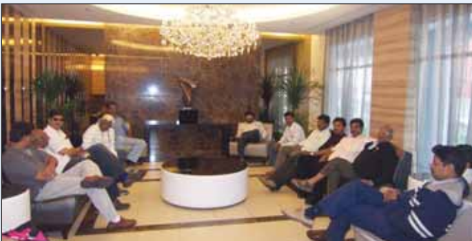
FIAAP delegation waiting for registration at JEC show

The above show was held from 22 – 24 Oct 2008 at Singapore. A delegation of 18 members from FIAAP visited the above show. The team has left Hyderabad on 19 th Night and reached back on 26 Oct 2008 night.