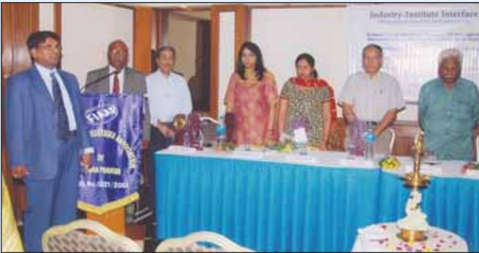
Speakers on the eve of Industry Institute Interface meet smile for a photograph

Composites Manufacturing and Applications The date and Venue has since been fixed and the program details are indicated in the following pages.