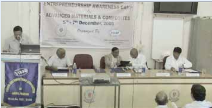
Principal, College of Engineering addressing the delegates