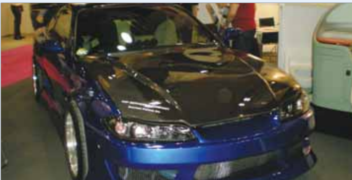
Fully composite car on display at one of the stalls

The Exhibition has displayed new developments in composites and also new process machines developed by various machine manufacturers. A new type of Wind mill is highlight of the Exhibition. A car with full of composite materials was also attracted most visitors. A proto type of composite train where almost 80% of the train was with composites also drawn huge crowds.