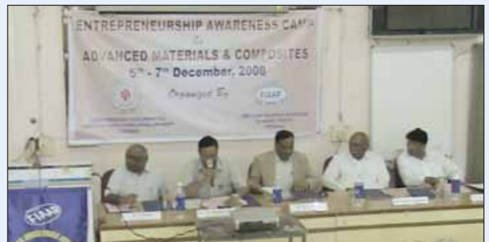
Inaugural function of enterpreneurship awareness camp

A 3 day Entrepreneurs Awareness program on Composite Industry was organized from 5 Dec to 7 Dec 2008, at Seminar Hall of JNTU College of Engineering, Jointly by EDC Cell of JNTU and FIAAP. The Program was covered about the statutory requirements and financial aspects on the first day and full power point technical sessions on composites on the 2 nd day.